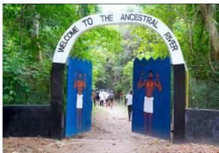
Assin Manso River

Day 7: July 21 – Check out of the hotel and travel through farming towns and villages to Assin Manso, then on to Kumasi. Check into the hotel.