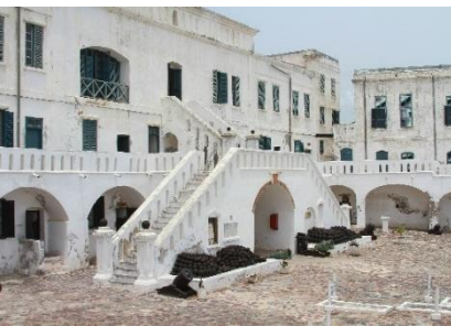
Cape Coast Castle

Day 4: July 26: - A day at your leisure to pursue your individual interests.