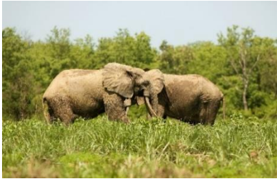
Elephants in Mole Park

Day 9: July 31 - Early morning and late afternoon drive safaris in Mole National Park to observe animals, big and small, in their habitats. After breakfast, visit with the people of the Mognori Eco Village, just 15 km outside the entrance to the park.