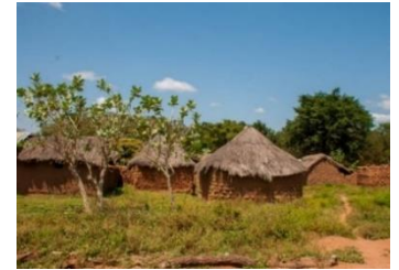
Traditional Mud House

Day 9: July 31 - Early morning and late afternoon drive safaris in Mole National Park to observe animals, big and small, in their habitats. After breakfast, visit with the people of the Mognori Eco Village, just 15 km outside the entrance to the park.