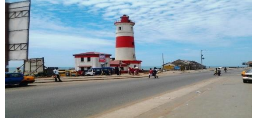
Jamestown Light House

Day 2: July 24 – Guided tour of Accra, old and new, enjoying museums and historical sites.