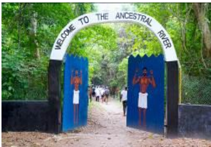
Assin Manso River

Day 6: July 28 – Check out of the hotel and travel through farming towns and villages to Assin Manso, then on to Kumasi. Check into the hotel.